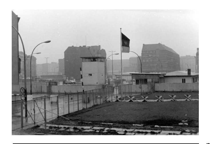
The East German side of Checkpoint Charlie.